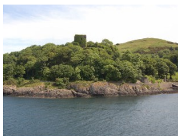
- Stevenson's Light - - Dunollie Castle - - The Dog Stone - - St John The Divine Cathedral -