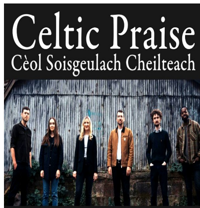
Corran Halls Sunday 13th October 7.30pm

As part of the Royal National Mòd, Hope2Oban are hosting Celtic Praise an evening of soloists, choirs and community singing led by special guests Celtic Worship. .... all are welcome.... donations welcome.