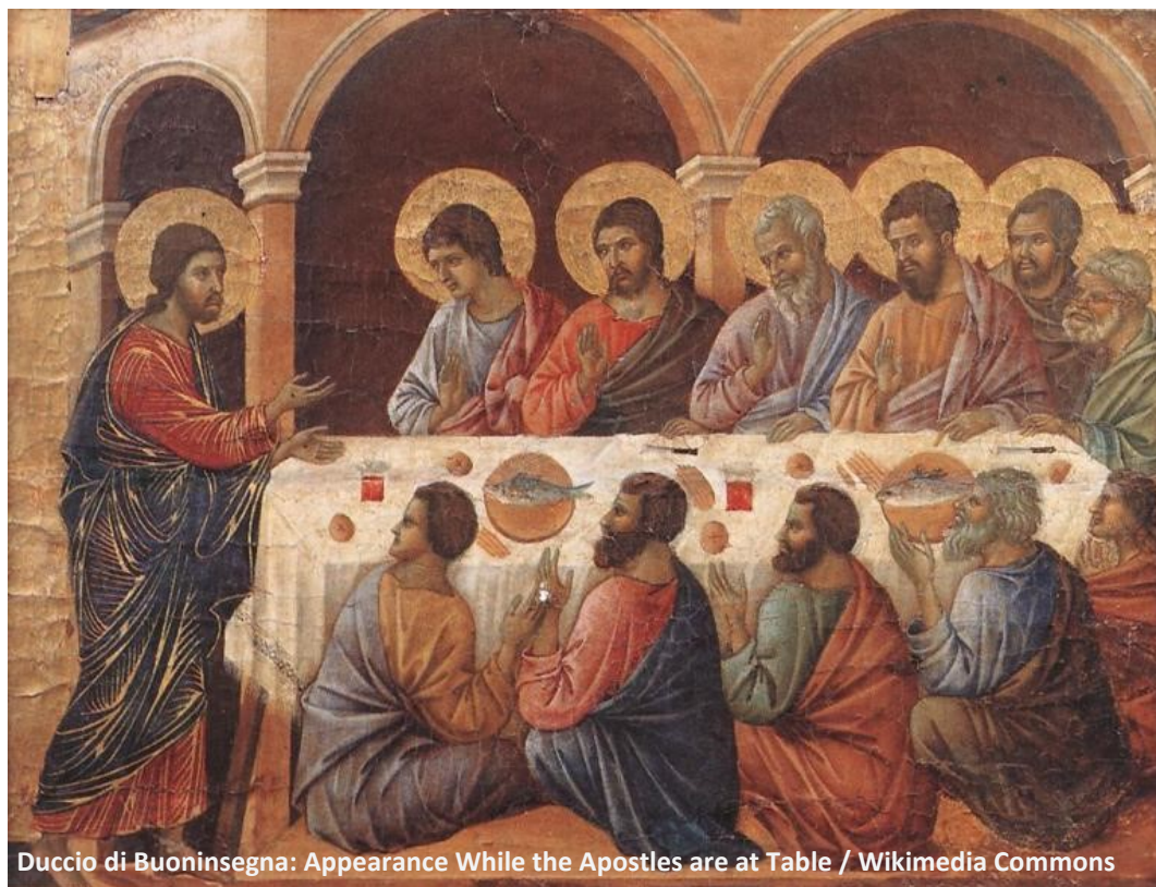
Duccio di Buoninsegna: Appearance While the Apostles are at Table

While they were talking about this, Jesus himself stood among them and said to them, "Peace be with you." They were startled and terrified, and thought that they were seeing a ghost. He said to them, "Why are you frightened, and why do doubts arise in your hearts? Look at my hands and my feet; see that it is I myself. Touch me and see; for a ghost does not have flesh and bones as you see that I have." And when he had said this, he showed them his hands and his feet. While in their joy they were disbelieving and still wondering, he said to them, "Have you anything here to eat?" They gave him a piece of broiled fish, and he took it and ate in their presence.